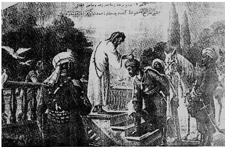
Figure 1. "Coronation" of Ahmad Khan Abdali. Translation of captions at top: No. 6. Drawing by Breshna, the famous contemporary Afghan artist. Sher-e Sorkh: The cluster of wheat is being placed on Ahmad Shah's turban.